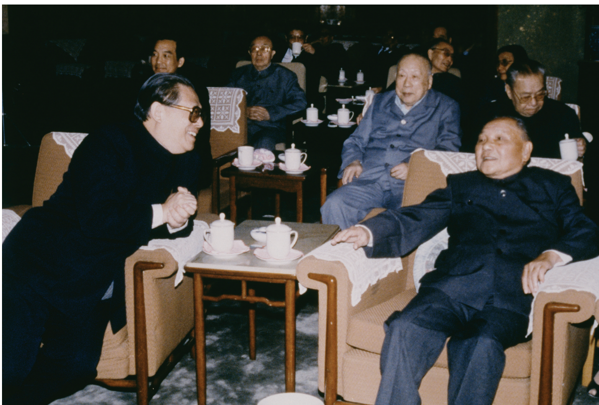
General Secretary of the Central Committee of the Communist Party of China Jiang Zemin and Chairman of the Central Military Commission Deng Xiaoping.

As in any political system, these rules were moulded by the short-term considerations. In 1997, then-general secretary Jiang Zemin pushed out a Politburo rival, Qiao Shi, by declaring a 70-year-old retirement rule, even though Jiang himself was 71 at the time. 8 Jiang successfully pulled off a similar manoeuvre in 2002, now lowering the age limit to join the Politburo to 68, thus ending the career of another rival, Li Ruihan. Despite the circumstances of their creation, these rule changes have had an enduring impact.