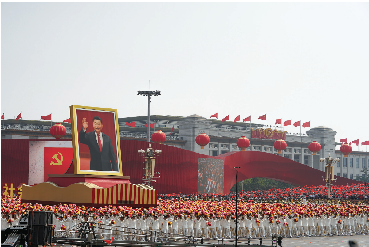
A portrait of Chinese President Xi Jinping looks is carried during the parade for the 70th anniversary of the establishment of the People's Republic of China, on October 01, 2019 in at Tiananmen Square, Beijing, China.