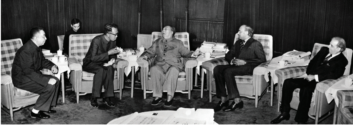
A picture released by Chinese official agency shows President Mao Zedong (C) on May 27, 1976 in Beijing during his meeting with Pakistani Prime minister Zulfikar Ali Bhutto (2 L).